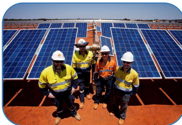
Workers at the De Grussa Solar Farm, Western Australia

The Australian Government has ratified the Paris Agreement and set a strong, credible and responsible target of reducing emissions by 26 to 28 per cent below 2005 levels by 2030.