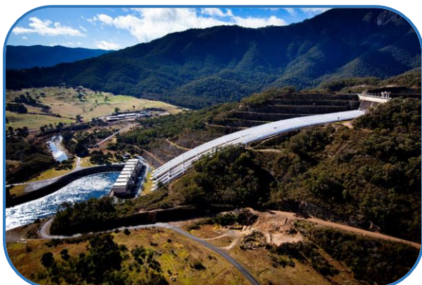
Snowy Hydro scheme