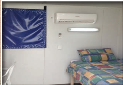
Typical Bedroom Set-up of MSC Camps