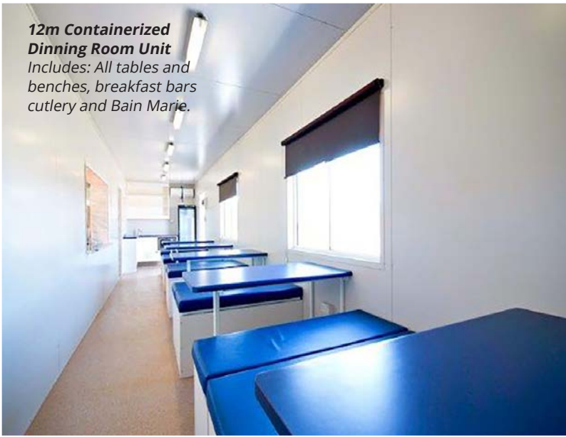
12m Containerized Dinning Room Unit Includes: All tables and benches, breakfast bars cutlery and Bain Marie.