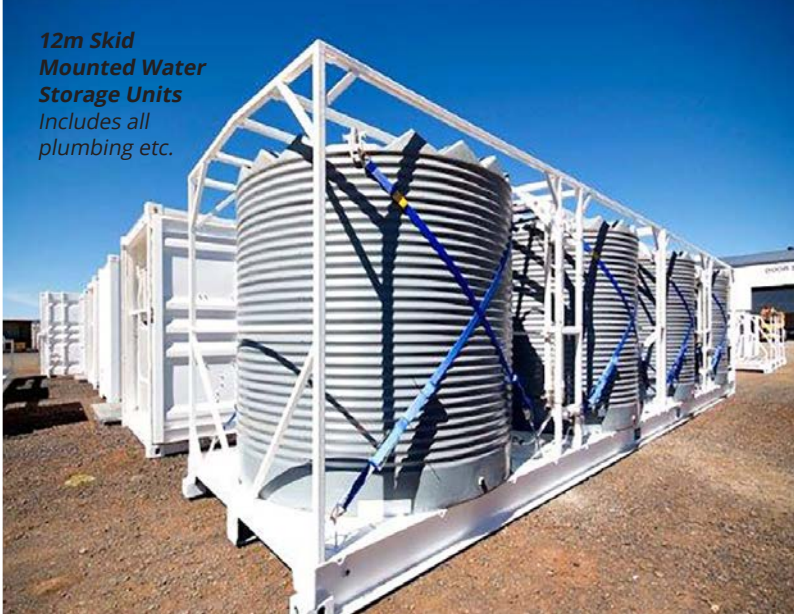
12m Skid Mounted Water Storage Units Includes all plumbing etc.