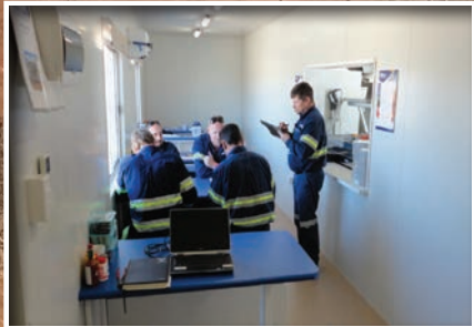
Dining Room of MSC Camps