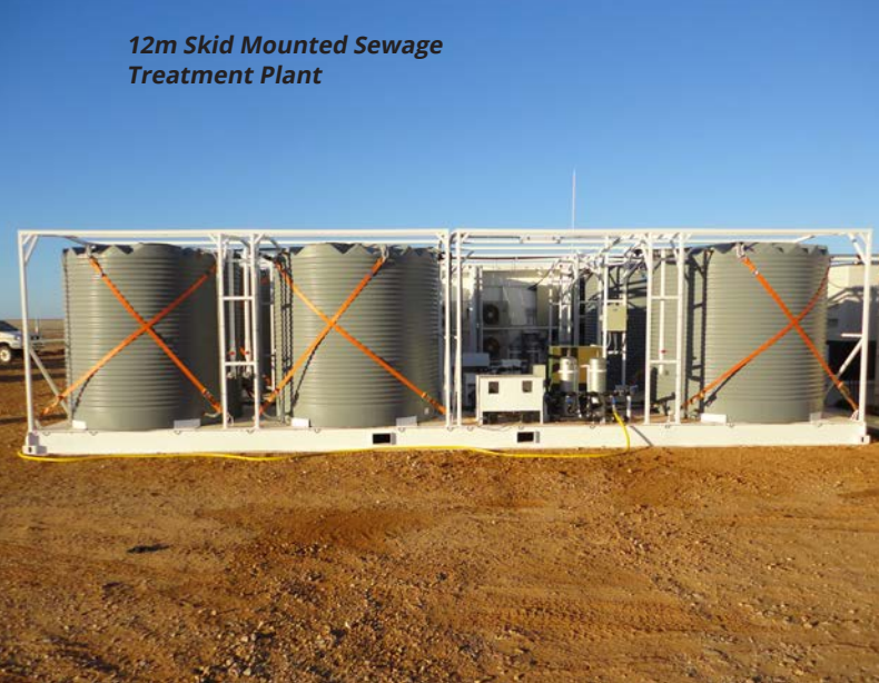
12m Skid Mounted Sewage Treatment Plant