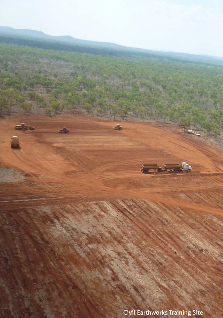
Civil Earthworks Training Site