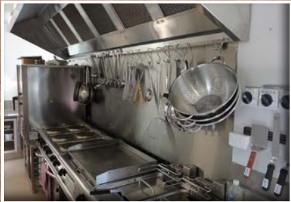
Typical Kitchen Set-up of MSC Camps