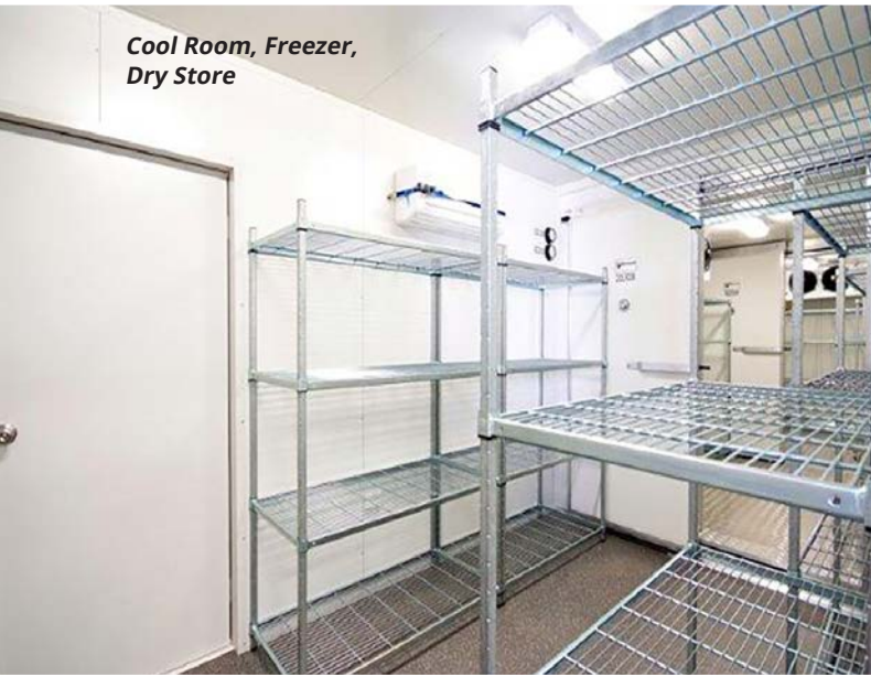
Cool Room, Freezer, Dry Store