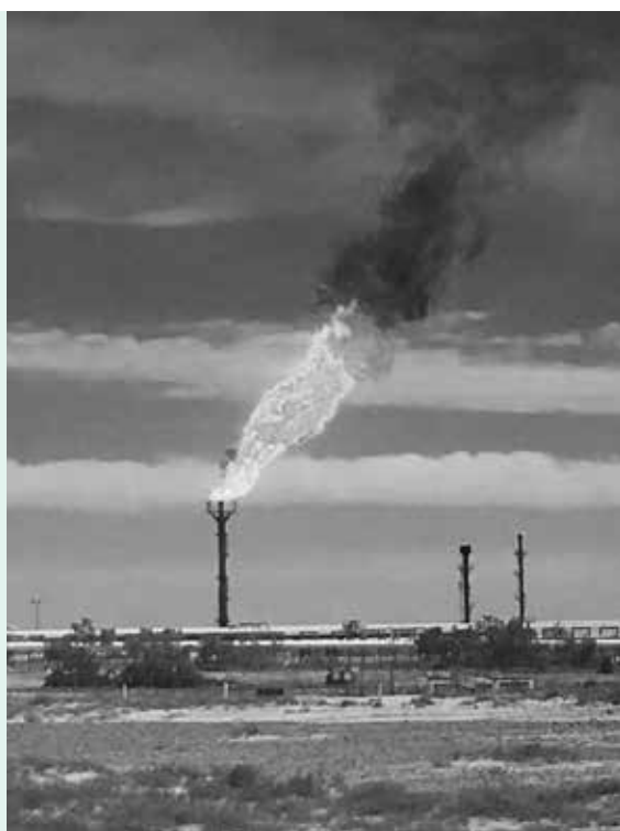
Flaring at a gas processing facility in Australia.

These standards will also serve to achieve possible reductions in CO 2 emissions at the upstream stage.